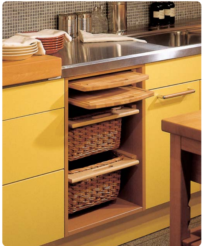
Beech frame and runners with natural wicker baskets shown above