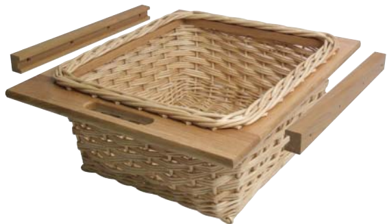
European oak frame and runners with white wicker baskets